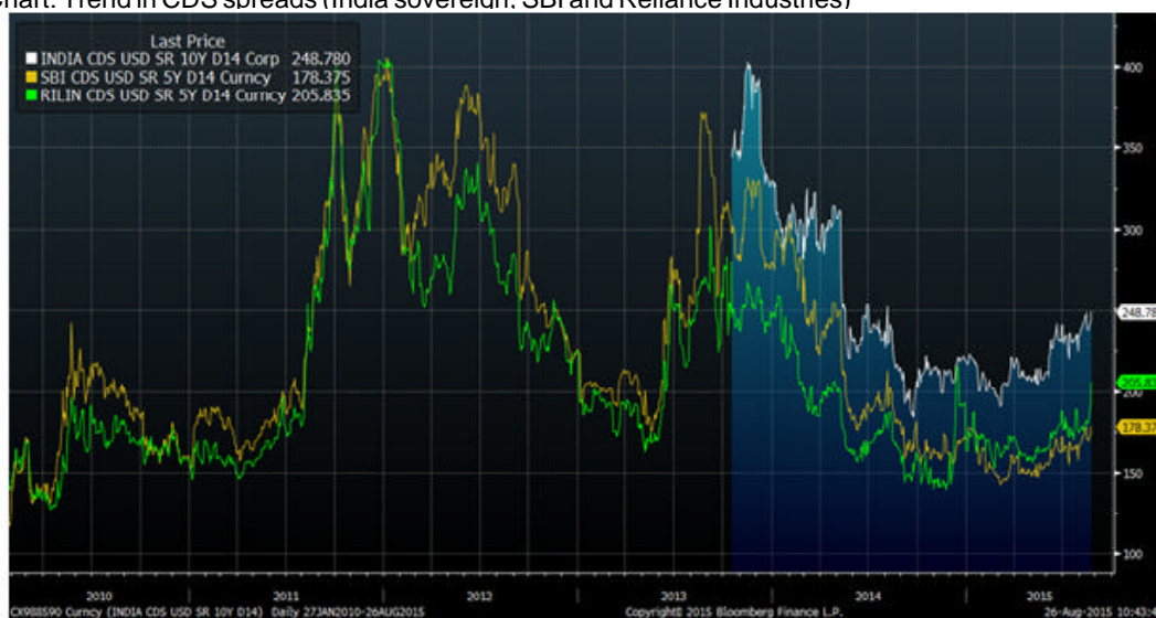
Chart: Trend in CDS spreads (India sovereign, SBI and Reliance Industries)

Although sovereign CDS spreads are available for India, liquidity is limited. USD CDS spreads are available for few of the Indian corporates and banks, which are fairly liquid.